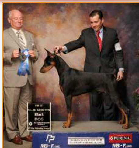
Dog - 12-18 Mos. BLK Aludra's Memphis Blues S Duval/K Bahr