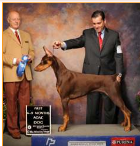
Dog - Puppy 6 - 9 Mos. AOAC Goldgrove First Class Sara Self/Ryan Self