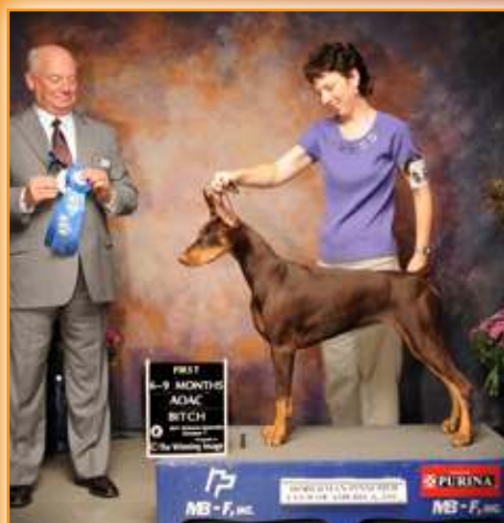
Bitch - 6-9 Mos. AOAC Kaliber's Tennessee Waltz N Raffa-Sodel