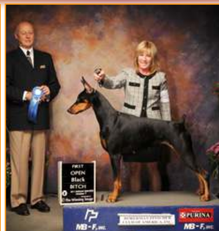
Bitch - Open BLK Niklbys True Supa Starr B Cuzzolino/A Cuzzolino