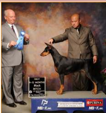
Bitch - 9-12 Mos. BLK Goldgrove Heaven 'N Paradise Mikadobe T Chan/G Chan/S Pflueger