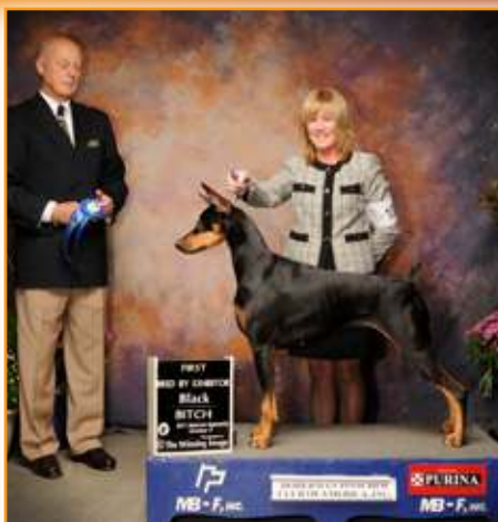
Bitch - Bred By Exhibitor BLK Niklby's Color Me Purple B Cuzzolino/A Cuzzolino