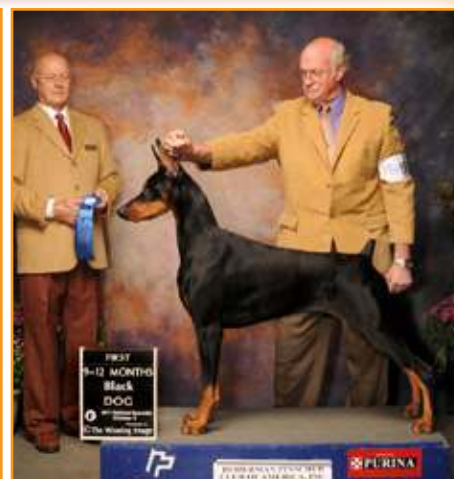
Dog - Puppy 9-12 Mos. BLK Rich-Lie Captain Navarre Of Aquila M Almy