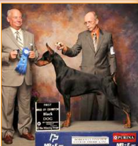
Dog - Bred By Exhibitor BLK Tiburon Aragorn W Gregory/J Dolan