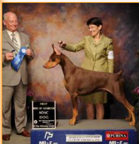
Dog - Bred By Exhibitor AOAC Allure Ready Aim Fire J Porter/C Pitts