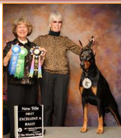
Excellent A Allure R-Star Alisaton RA R Gipp