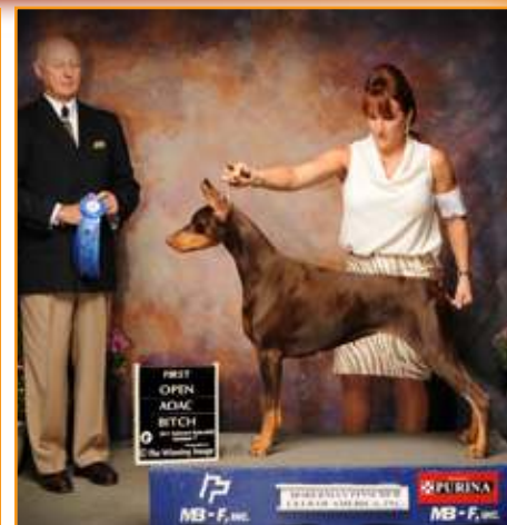
Bitch - Open AOAC Mystikos N Kettle Cove Eternal Love V Campbell/S Duval/d aunchman