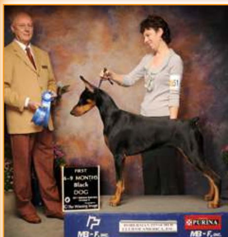
Dog - Puppy 6 - 9 Mos. BLK Kaliber's Unforgettable N Raffa-Sodel