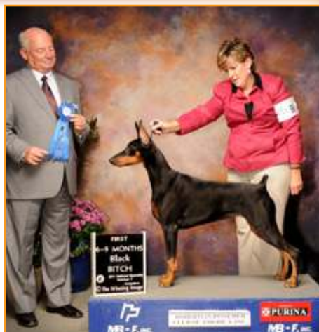
Bitch - 6-9 Mos. BLK Kerwynd's Country Breeze S Kershaw