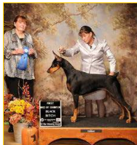
Bitch - BBE Black QUARTET'S DIAMOND HEART Owners: Wende Call