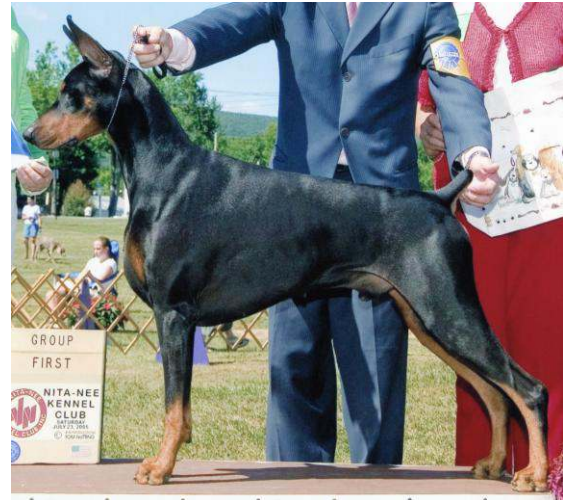
Very Good Dog

Below are photos of very good male and female Dobermans. These images should be so affixed in your mind that you can very quickly compare a Doberman standing before you to the mental image of the ideal.