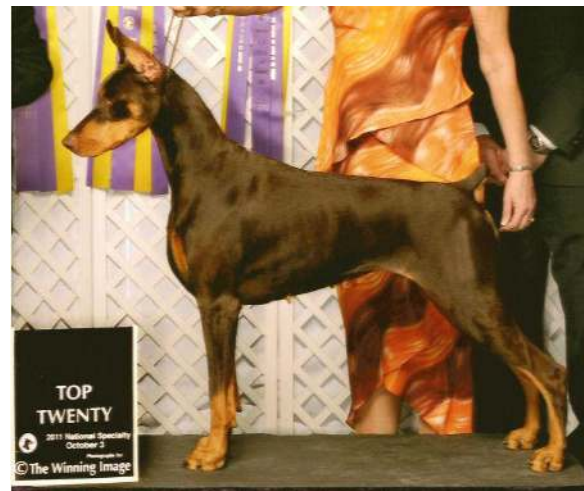
Very Good Bitch

You can see from these images the compactness, the correct head proportion, the proper neck that flows smoothly into the 90° front angulation. You will observe the solid slightly sloping topline ending in a 2 o'clock tailset with a moderate underline and with rear angulation that matches the front. With the silhouette, you will see the strong substance, cat tight feet and athleticism.